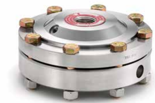
740-41 High Displacement Threaded Seal