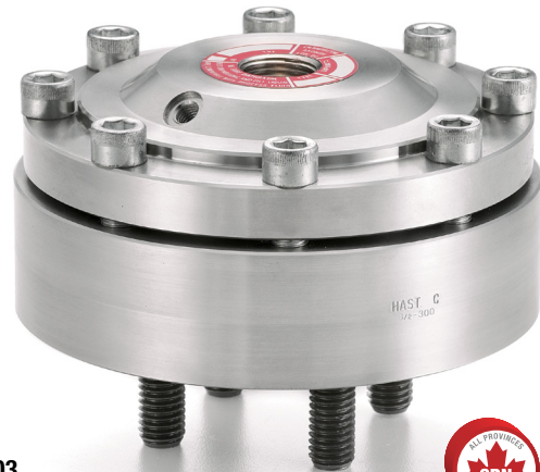
702-703 Flanged Seal