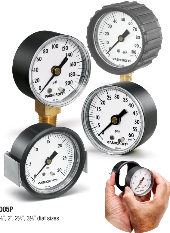
1005P 1½", 2", 2½", 3½" dial sizes