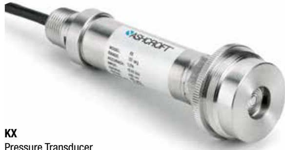
KX Pressure Transducer